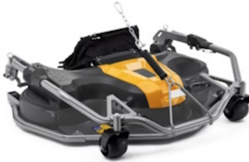
Combi Pro 110 Q Plus