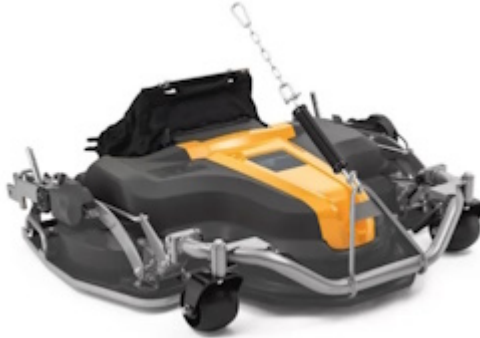
Combi Pro 100 Q Plus

Driven by a powerful Honda GCV530 twin-cylinder engine – one of the most well-known and reliable engines of its kind.